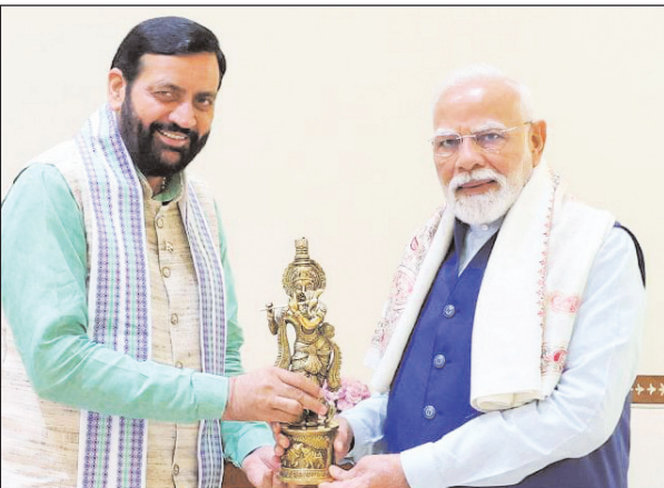
Haryana Chief Minister Naib Singh Saini paid a courtesy call on Prime Minister Narendra Modi in New Delhi .

hidden possibilities in India. The Prime Minister said that the influence of Indian culture has increased in all parts of the world and there has been an increase in love and reverence for Ramayana and Mahabharata. The Chief Minister said that the Prime Minister's address infuses new energy in the common people.