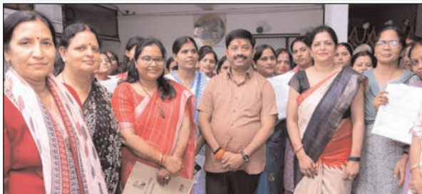
Special priority to the campaign to modernize the Anganwadi centers: Nandi

Prayagraj. On Sunday, under the Child Development Services and Nutrition Department, Minister, Industrial Development, Export Promotion, NRI, Investment Promotion, Uttar Pradesh Government Nand Gopal Gupta (Nandi) distributed appointment letters to 40 newly selected candidates in Vidhan Sabha City South out of a total of 452 selected Anganwadi workers in Prayagraj district in the auditorium of Vikas Bhawan Prayagraj. The program was inaugurated by the Minister by lighting the lamp. The newly selected 40 candidates in Vidhan Sabha City South include 18 from Child Development Project City