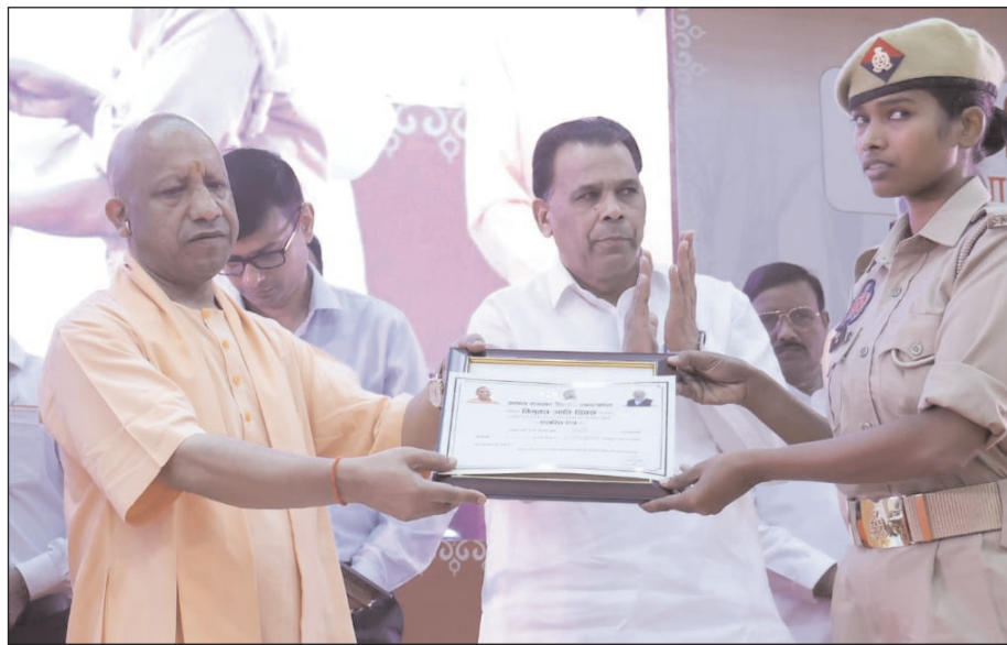
Hon'ble Chief Minister Yogi Adityanath on the occasion of the Vimukta Jati Diwas celebration organized for the welfare of the freed and nomadic castes at Bhaagidari Bhawan, Lucknow on Sunday.

transparent and fair by the state government through online process, in which all people are getting equal opportunity in our government without any discrimination, which fulfills the commitment of our government of Sabka Saath, Sabka Vikas, Sabka Vishwas.